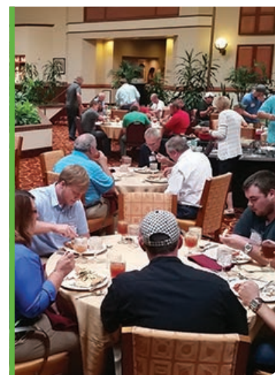
Stella-Jones generously sponsored an ample reception for the participants who dug in eagerly after a full day of instruction.